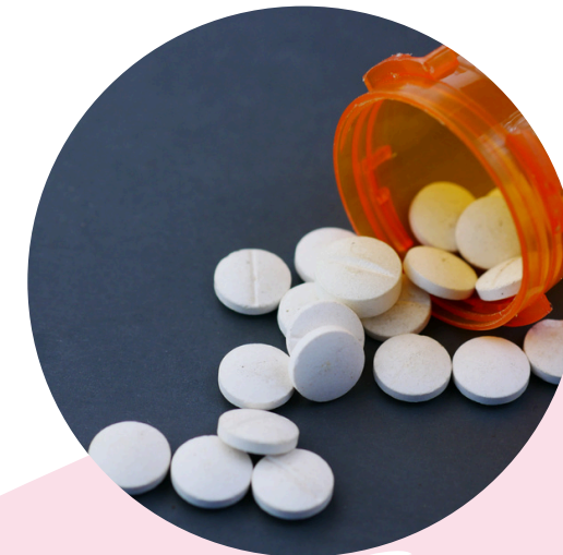
PRESCRIPTION DRUG ACCESS